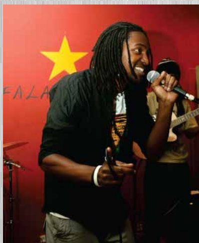
Mafalala Libre, Maputo