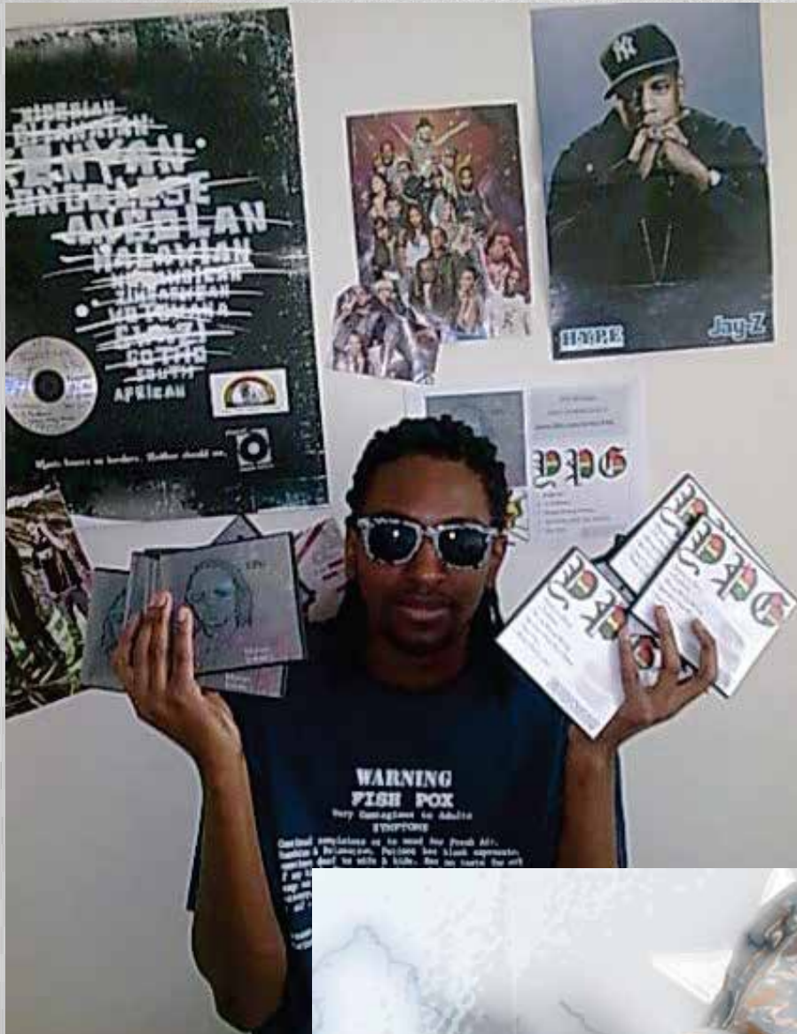
Mixtape Vol. I Promo.