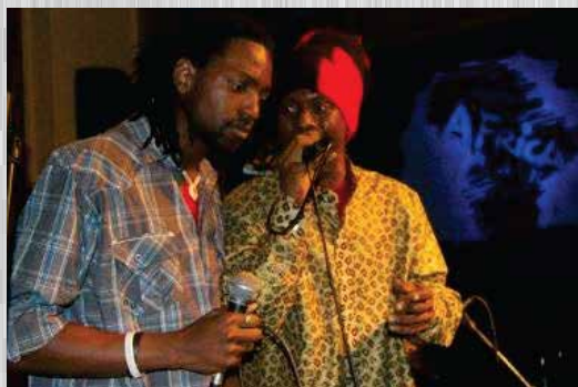
Africa Bar, Maputo