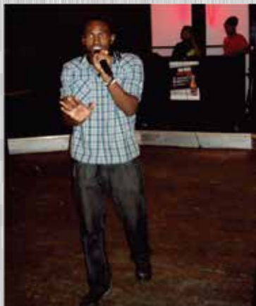
Stones, Hatfield, Pretoria

In the years to come, YPG went on to perform at numerous events, festivals and self-organized concerts.