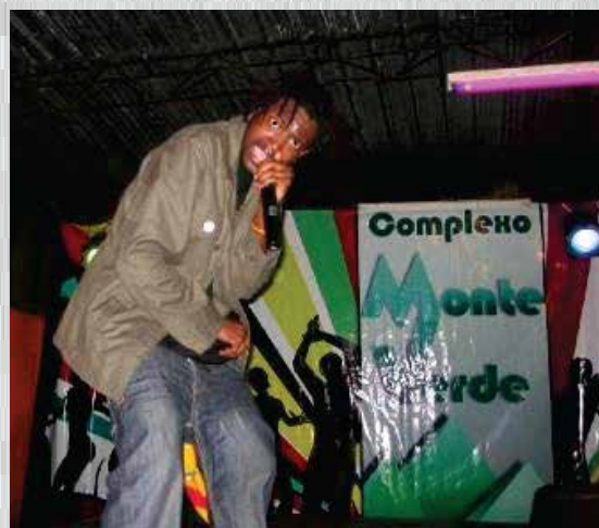
Complexo Monte Verde, Beira