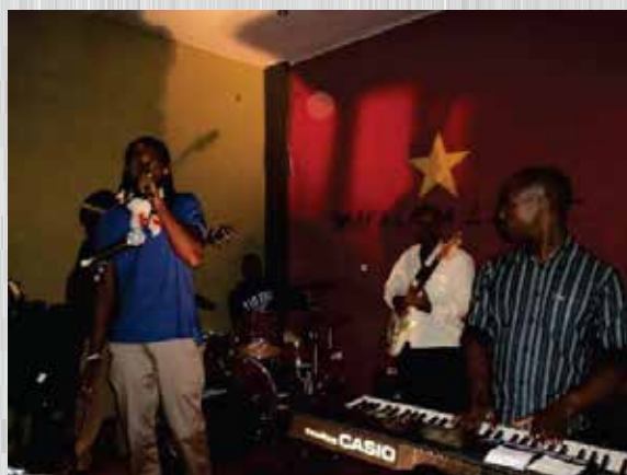
Mafalala Libre, Maputo