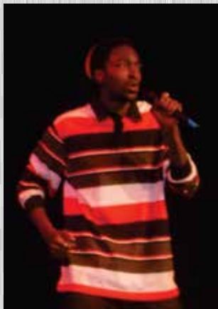
Pretoria State Theatre