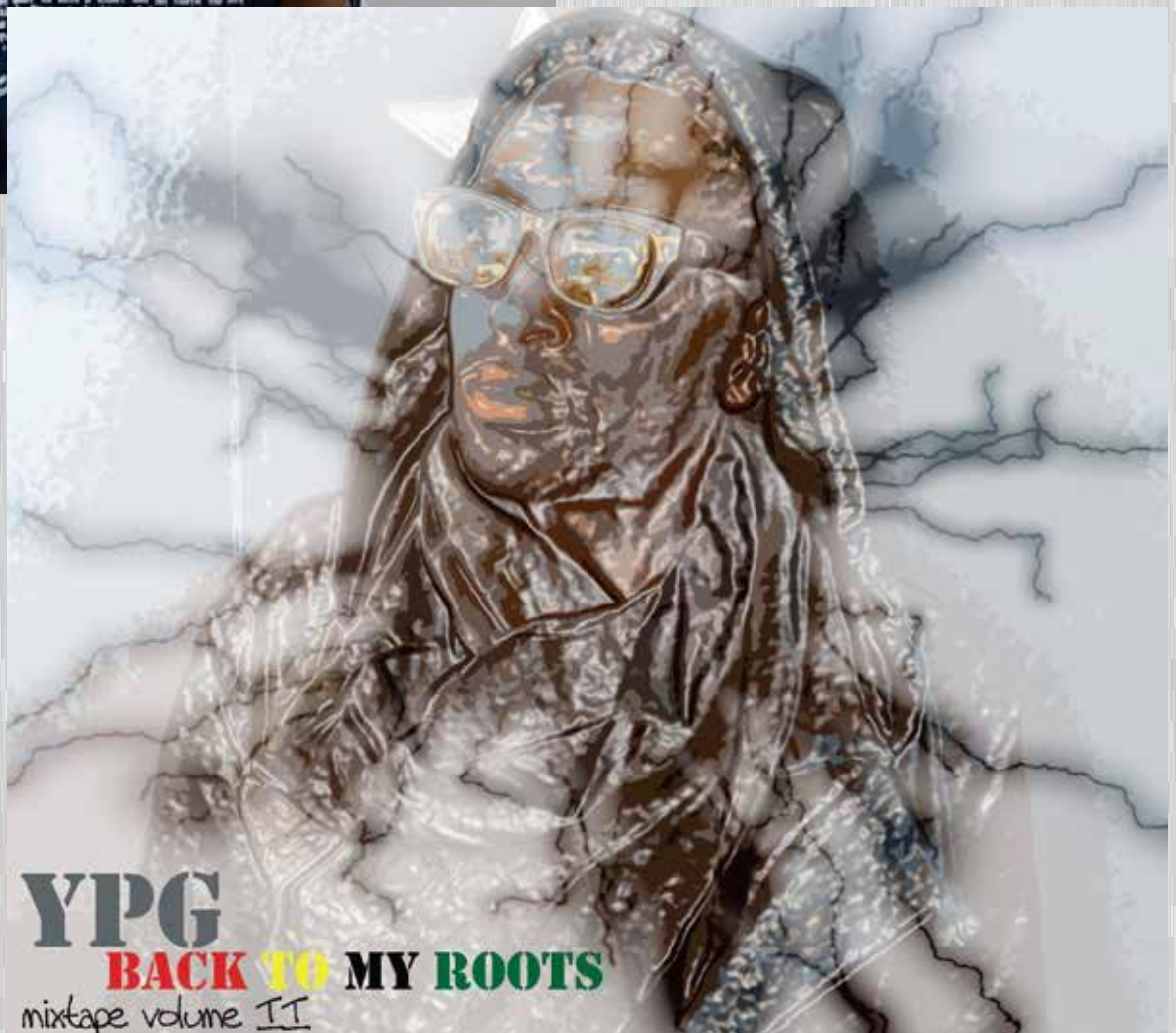
Mixtape Vol. II Cover.