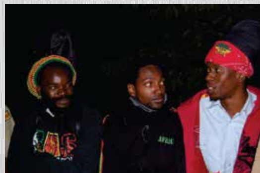
Bob Marley Memorial, CCFM, Maputo